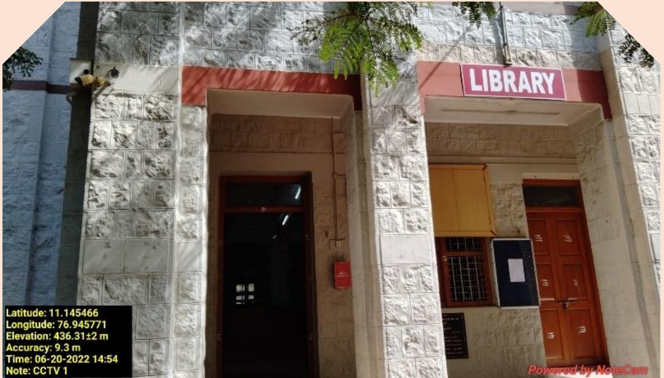
CCTV at Library