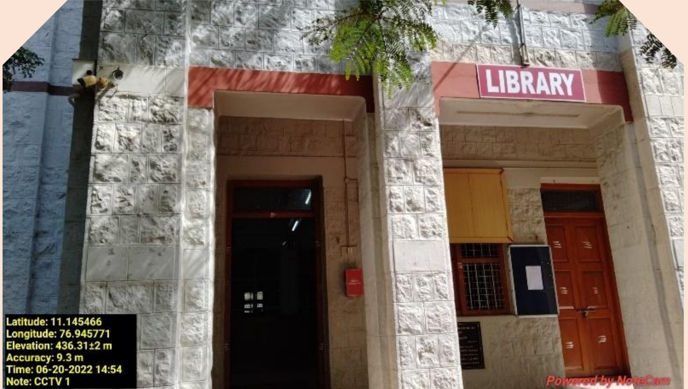
CCTV at Library