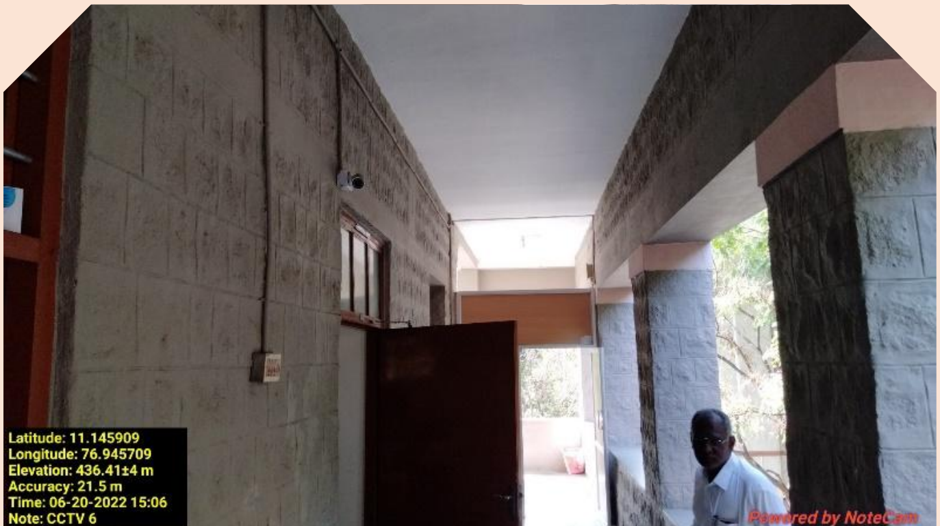
CCTV at Office Veranda