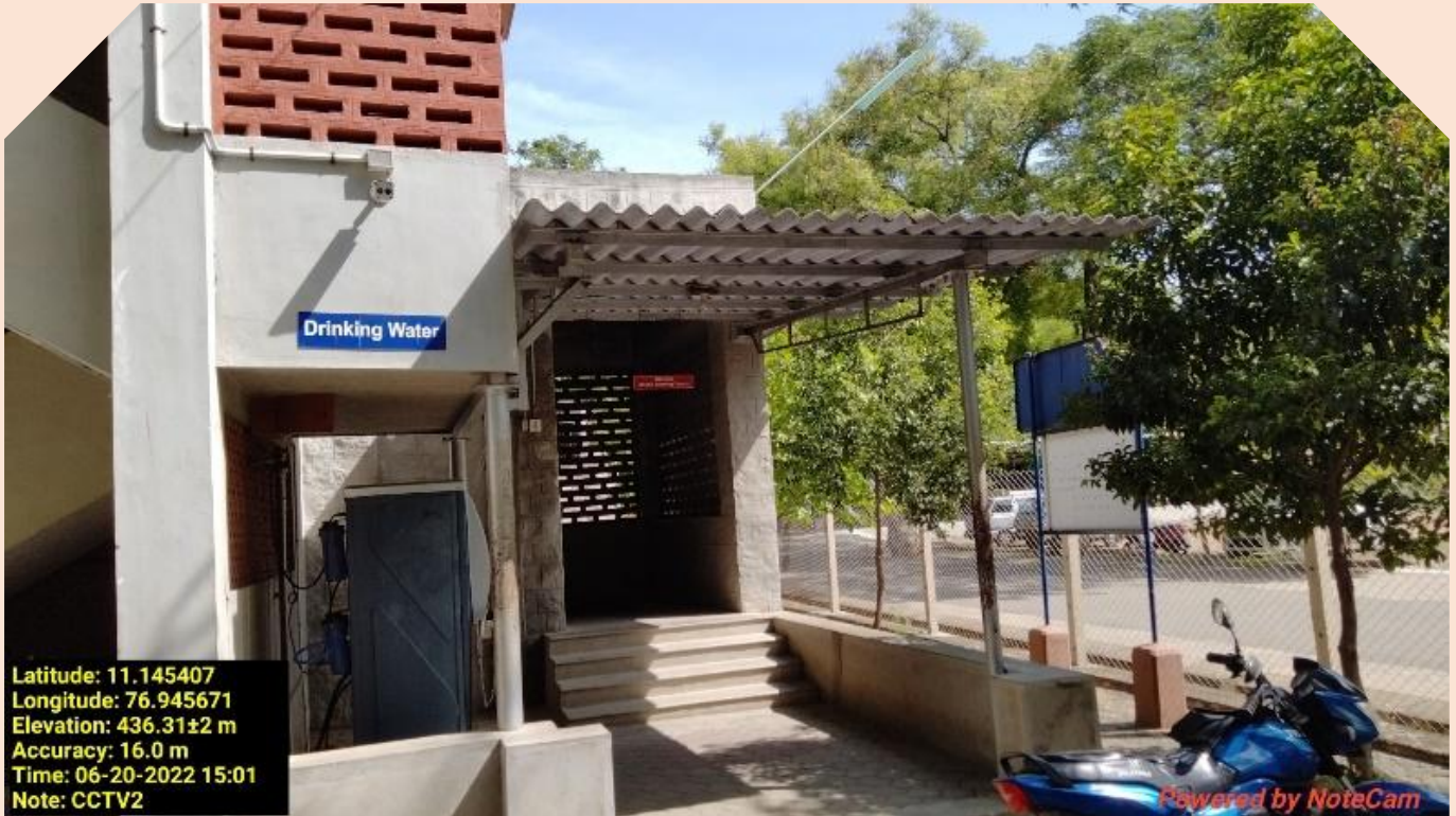
CCTV at Parking