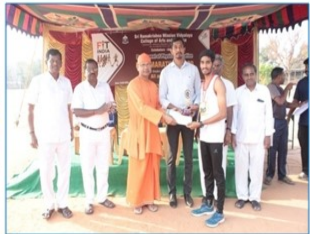
Inter Vidyalaya "Mini Marathan 2020 Inauguration and Prize Distribution on 16.02.2020