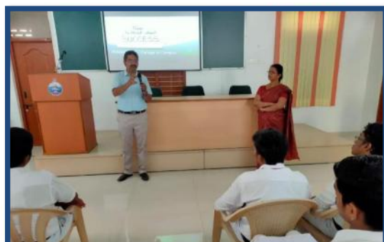
Trainers on their business

The trainers effectively conducted the ice-breaking sessions and opened the students to the basis of communication, strong positive affirmation and language learning and consistency. The students were exposed to barriers & factors of communication and basic aptitude overview. Many games had been conducted to develop interest of the students and activities to eliminate fear of speaking and ideal speaking exercises were involved the student volunteers.